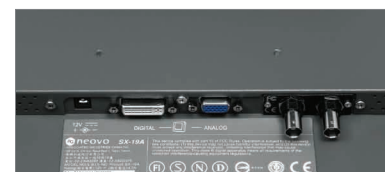
Looping BNC video connector for multiple display connections