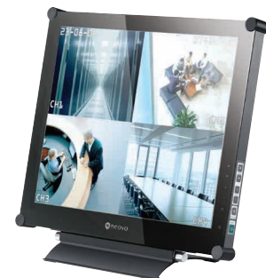
Specifically designed and tested for commercial video security applications