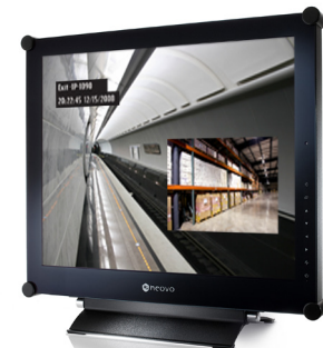
Smart Omni Viewer provides flexible image viewing options such as PIP/PAR, freeze, 180° image rotate