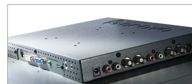
Ultimate video versatility, including passive looping BNC video for multiple display connections