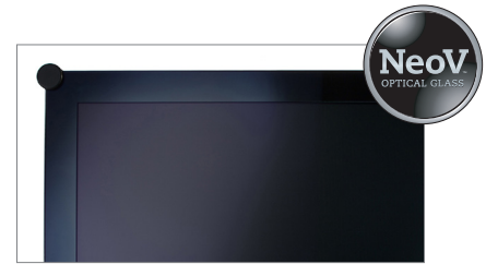
NeoV™ Optical Glass for secure protection and IP22-compliant metal housing design for ingress prevention