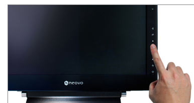
Unique touch sensor control design allows convenient access to the OSD menu