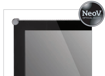
NeoV™ Optical Glass for hard glass protection and strong metal casing for secure mounting