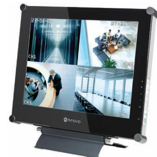
Specifically designed and tested for commercial video security applications