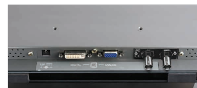
Looping BNC video connector for multiple display connections