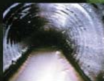
Service Water Line – Baseline Inspection

The ultimate solution for large-diameter pipe inspections.