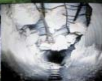
Concrete Pipe – Collapse