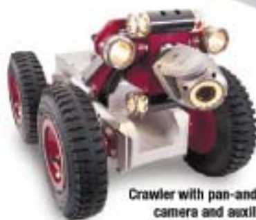
Crawler with pan-and-tilt camera and auxiliary lights on top