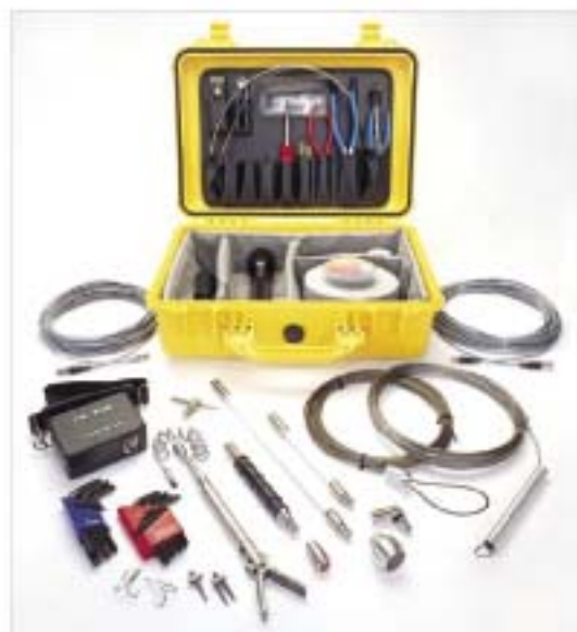
9500-9000 Retrieval Tool Kit Durable kit that houses a variety of retrieval tools and accessories

Everest-VIT COMPLETELY FOCUSED ON REMOTE IMAGING™