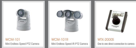
WCM-101 Mini Endless Speed PTZ Camera