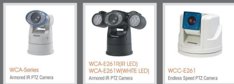
WCA-Series Armored IR PTZ Camera